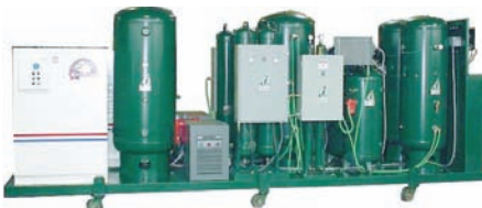
Medical Oxygen Generator Skid

With our worldwide base of installed equipment, OGSi has the engineering and manufacturing experience to meet your facility's needs. Our sales and service network is dedicated to keeping your oxygen generator system in top condition.