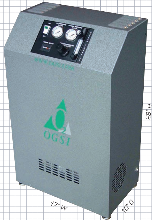
OG-15 WITH POWDER COATED STEEL COVER

With a lighted ON/OFF switch, integrated control panel, digital hours meter, custom flow gauges and controls, the OG-15 is truly user friendly. Just plug it in, turn it on, and set the desired pressure and flow. Check and clean the inlet air filter every 6 months, and you're done. The zeolite sieve (which actually separates oxygen from nitrogen) is regenerative, and should not need to be replaced for the life of the unit.