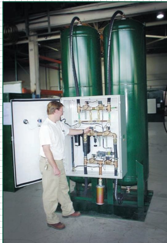
Model OG-1000 undergoing factory inspection