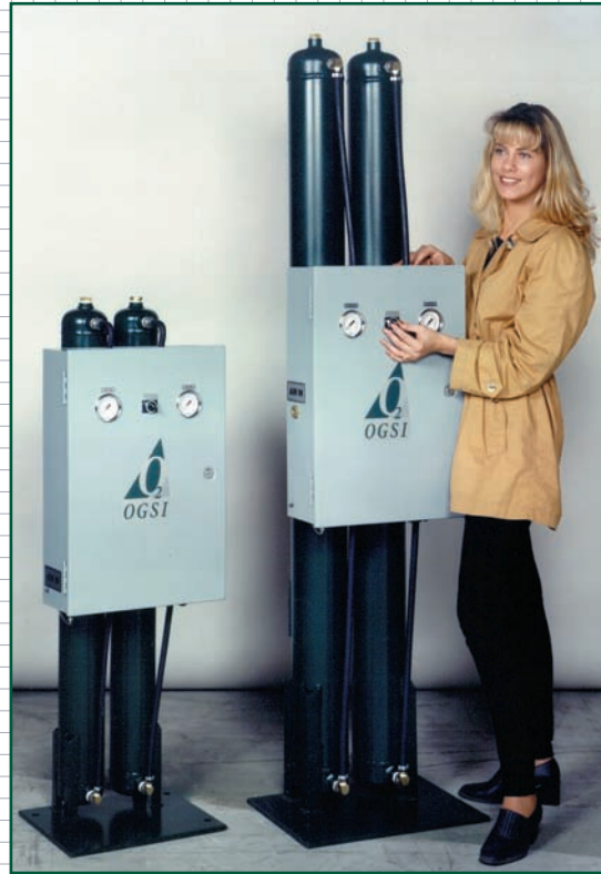
Model OG-25 and OG-100 Oxygen Generators

Visit www.ogsi.com for further specifications, drawings, manuals and photos of our full line of oxygen generators.