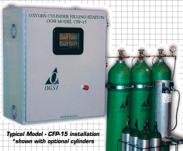
Typical Model - CFP-15 installation *shown with optional cylinders